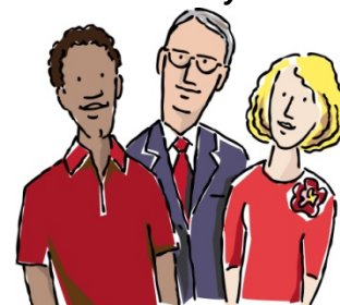
Wear Red for Pentecost