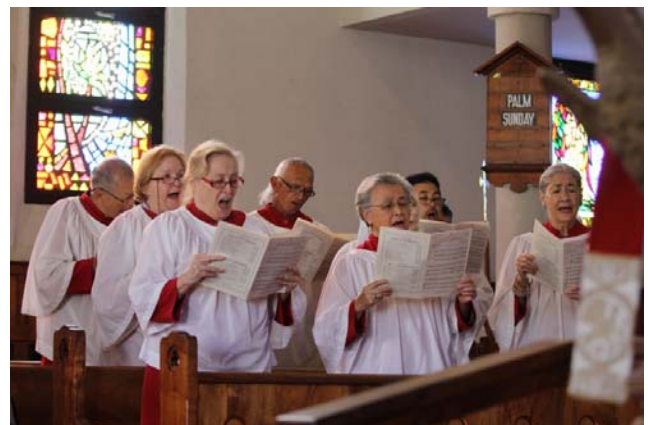
The Choir on Palm Sunday.