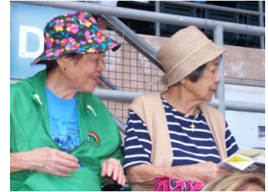
Sunday at the Ball Park