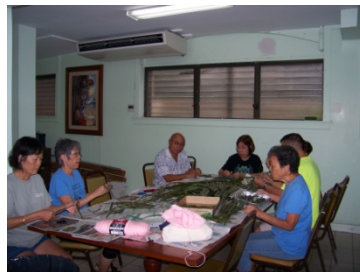
Folding Palm Crosses