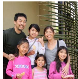
Palm Sunday Greeting