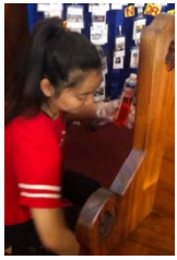
Priory School National Honor Society service project