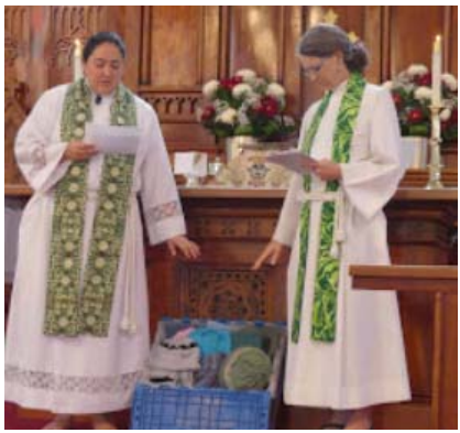
Blessed for the Pineridge Reservation. It is cold in S. Dakota