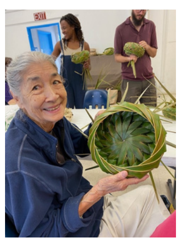
Hawai'i Quilt Guild Annual Show - Downtown Art Center, 1301 Nu'uanu Avenue (2nd floor)

May 2-14, 2023 (Tuesday-Sunday, 11am-6pm)