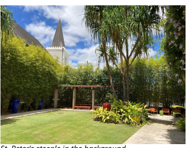
St. Peter's steeple in the background.