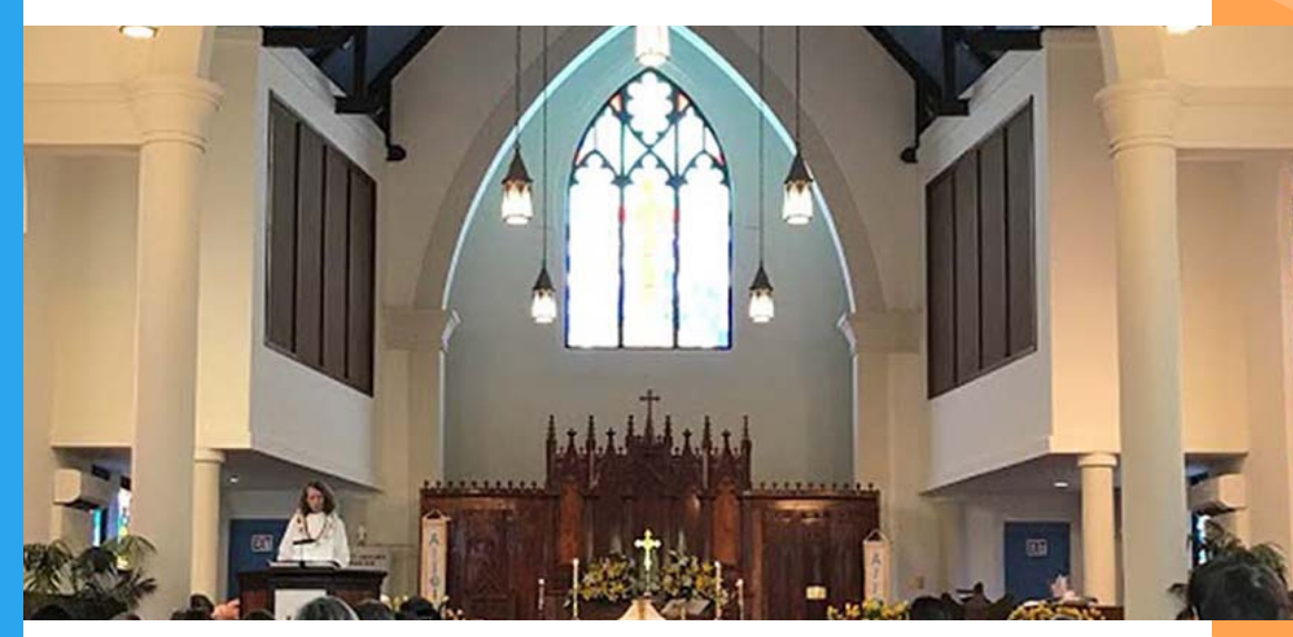
Thanksgiving service ~ November 24, 9:30am

Make a joyful noise to the Lord, all the earth. Worship the Lord with gladness; come into his presence with singing. Know that the Lord is God. It is he that made us, and we are his; we are his people, and the sheep of his pasture. Enter his gates with thanksgiving, and his courts with praise. Give thanks to him, bless his name. For the Lord is good; his steadfast love endures for ever, and his faithfulness to all generations. Psalm 100