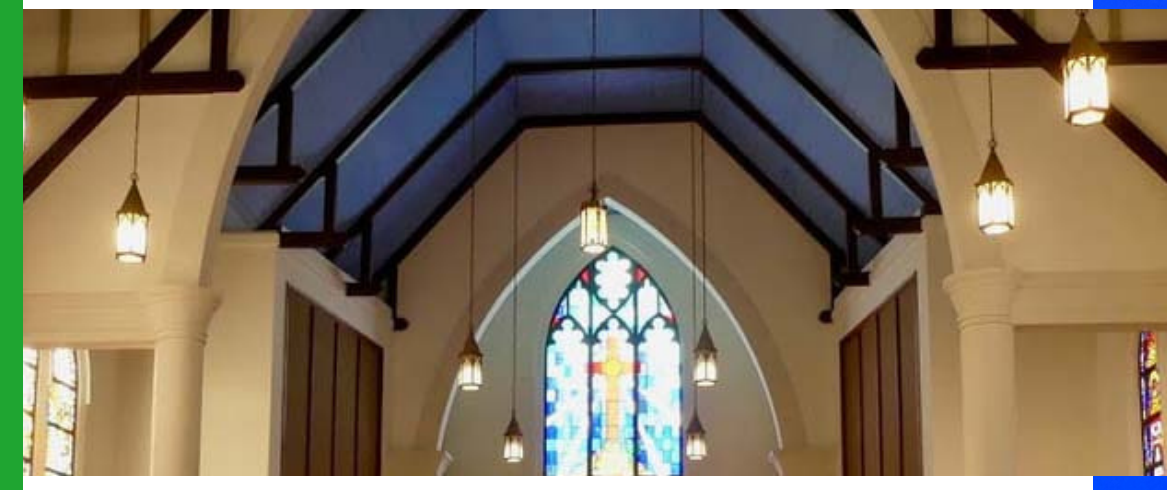
We've begun a new church year and a new season — Advent!

This is the time of expectant waiting for God's word to speak to us anew, a time to open our hearts to the mystery and joy of God's presence with us. Here are some ideas from The Episcopal Church to enrich your journey through these four weeks leading up to Christmas: